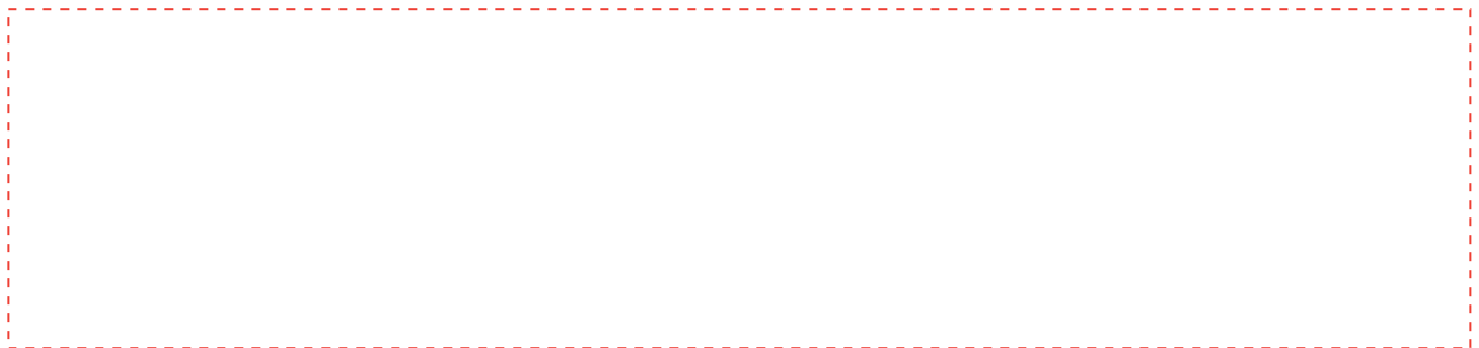
Wrap ad space